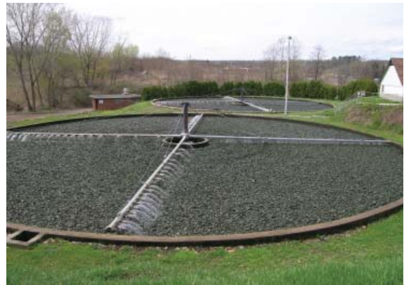
Many wastewater treatment facilities in New York are operating beyond their useful life expectancy.

Every year, old sewers flooded by stormwater release more than 27 billion gallons of untreated sewage into the New York Harbor alone... An inadequate sewage treatment infrastructure jeopardizes the viability of current and future businesses, stymies economic growth and threatens the quality of life for New York State residents.