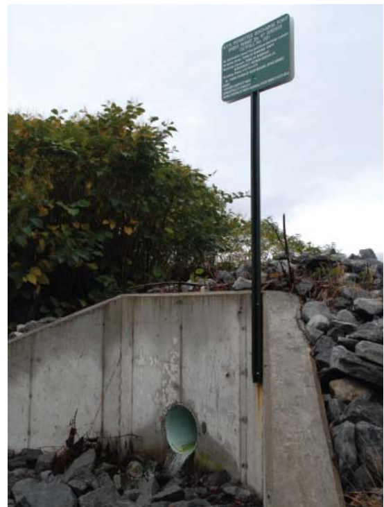
A wastewater treatment facility outfall. Clean water is discharged to our streams, rivers and lakes.